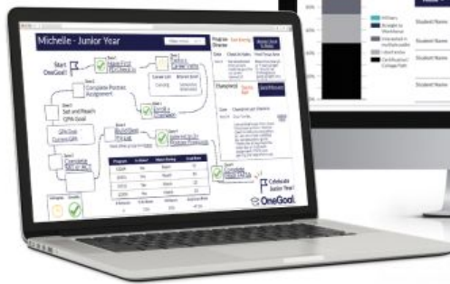
Fellow Milestone View