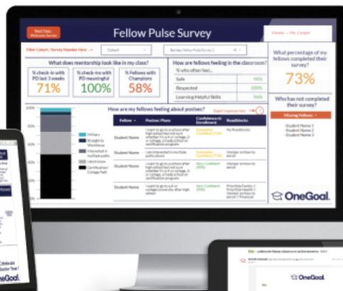
Program Director View