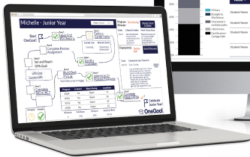
Fellow Milestone View

Participating schools and districts have access to a real-time dashboard that provides high-level insight into the student and teacher experiences during each program year.